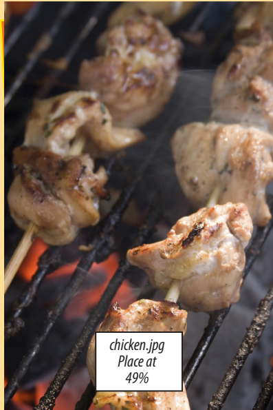
chicken.jpg Place at 49%