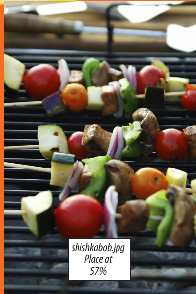
shishkabob.jpg Place at 57%